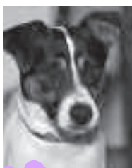
Tommy is ready for adoption!