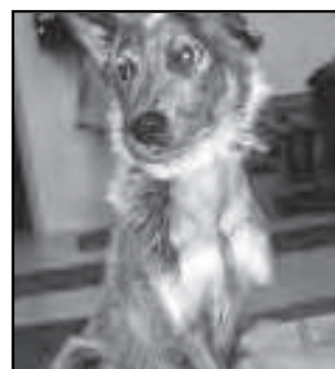
Cappy is a 10 month old cattle dog mix found with his leg severed in Spring Creek Township in July. Surgery costs of $250 paid for by the Humane Society will give him a second chance for a home.

Please call us if you can help in any way (814) 726-1961