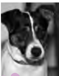
Tommy is ready for adoption!