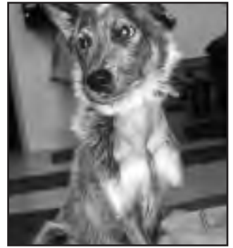
Cappy is a 10 month old cattle dog mix found with his leg severed in Spring Creek Township in July. Surgery costs of $250 paid for by the Humane Society will give him a second chance for a home.

Please call us if you can help in any way (814) 726-1961